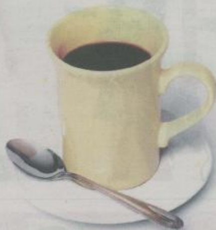
Starting the day with a coffee isn't the healthiest way to break that overnight fast. "You could be well on the way to being dehydrated without feeling the tiniest bit thirsty," Sue says.