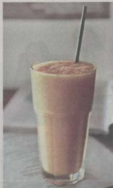
Fresh juice is a healthy way to start the day.