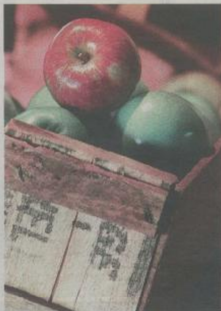
Fruit contains phyto-chemicals which, among other things, protect against cancer.