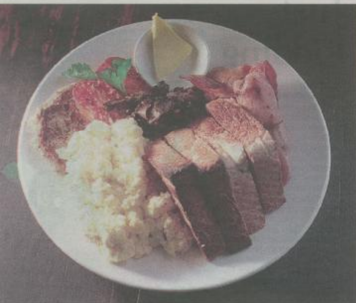
In Sue's breakfast comparison, the cafe-style breakfast costs the most and has the most kilojoules, sodium and fat, but this is still better than skipping brekkie.