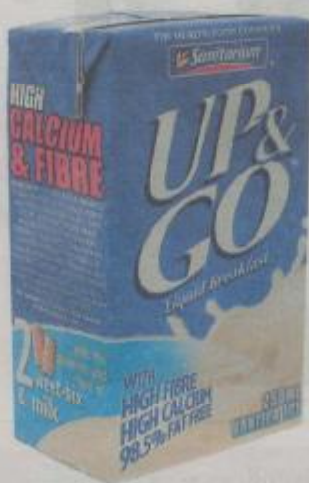
Liquid breakfasts won't provide enough energy for the day and shouldn't be used as a permanent replacement for sit-down breakfast.